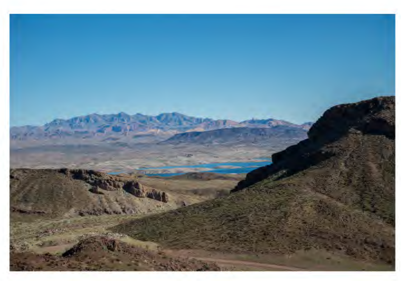
FOR THE YEAR ENDED JUNE 30, 2021